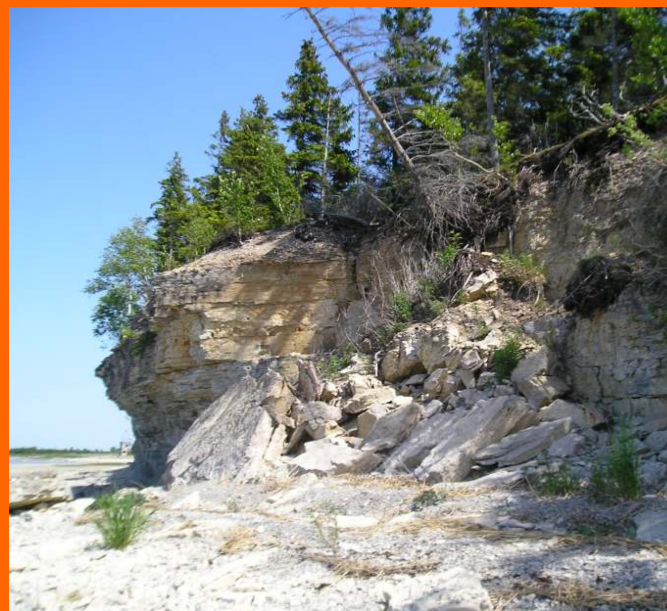
Pankrannik Coastal cliffs