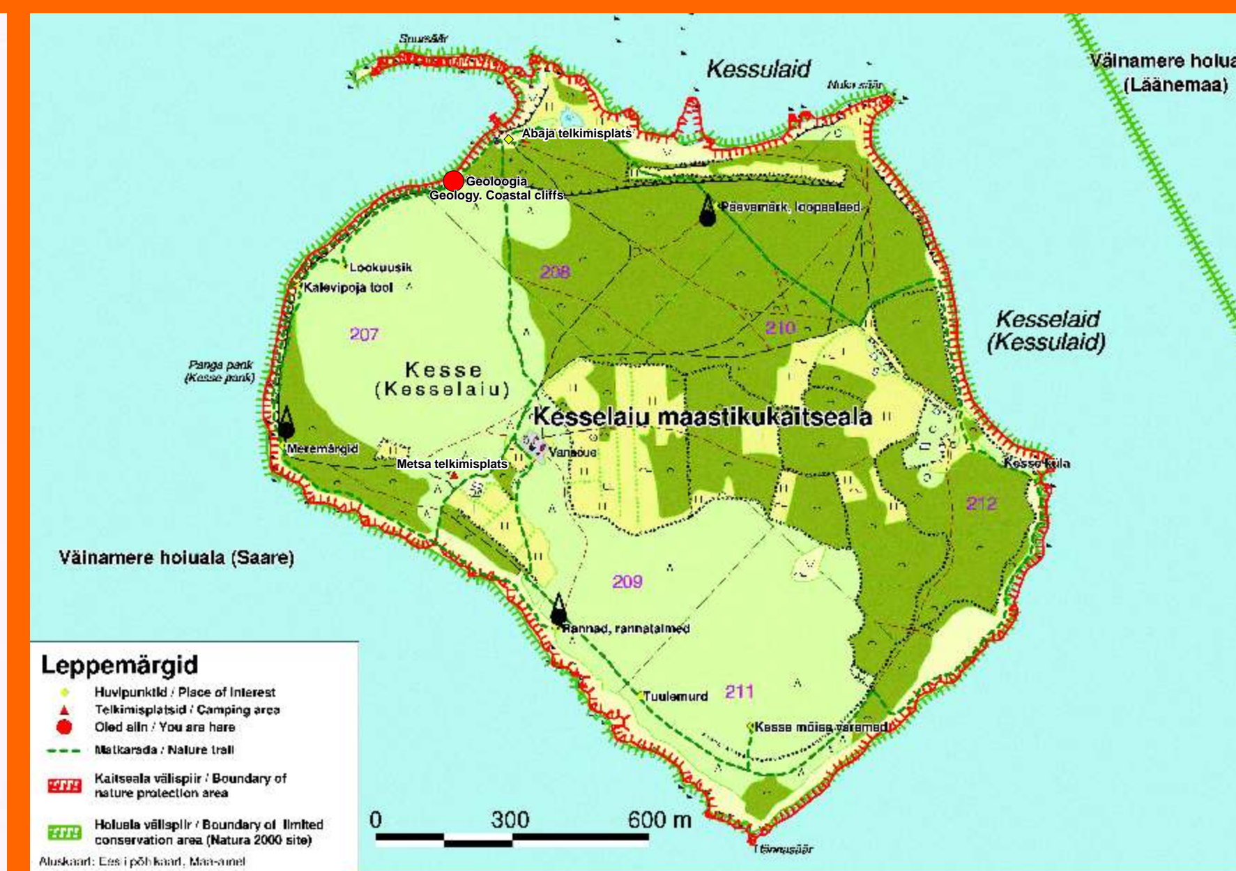
Leppemärgid Huvipunktid / Place of Interest Tellemisplatsid / Camping area Oled siin! / You are here Mälgurada / Nature trail Kaitseala villagil / Boundary of nature protection area Hoiuala villagil / Boundary of Embled conservation area (Natura 2000 site) Aluskart: Eesti põhi kaart, Maa- ja metsamajandus